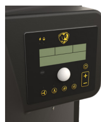
Onboard Control Panel