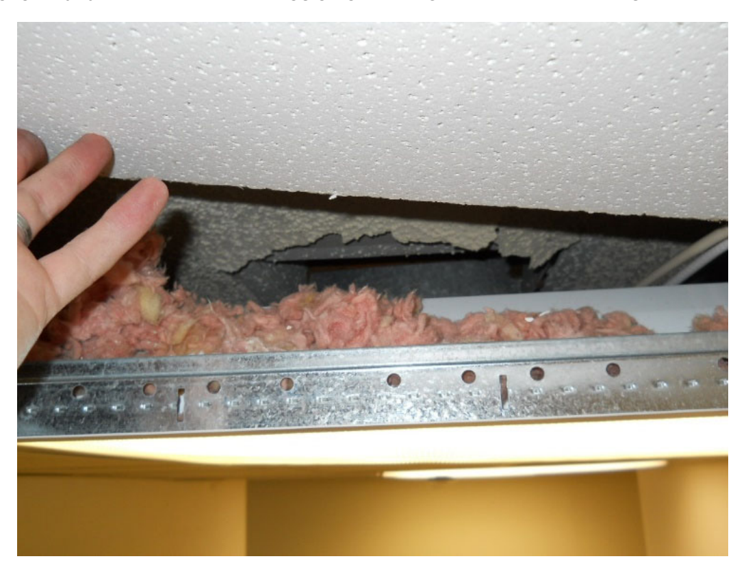
PHOTO 8 - 9/29/21 - LOCALIZED PEELING CEILING TREATMENT IN THE EASTERN HALLWAY