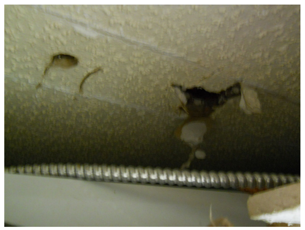
PHOTO 10 – 9/29/21 – LOCALIZED DAMAGE AND AIR EROSION OF CEILING TREATMENT ABOVE CUBICLE 31