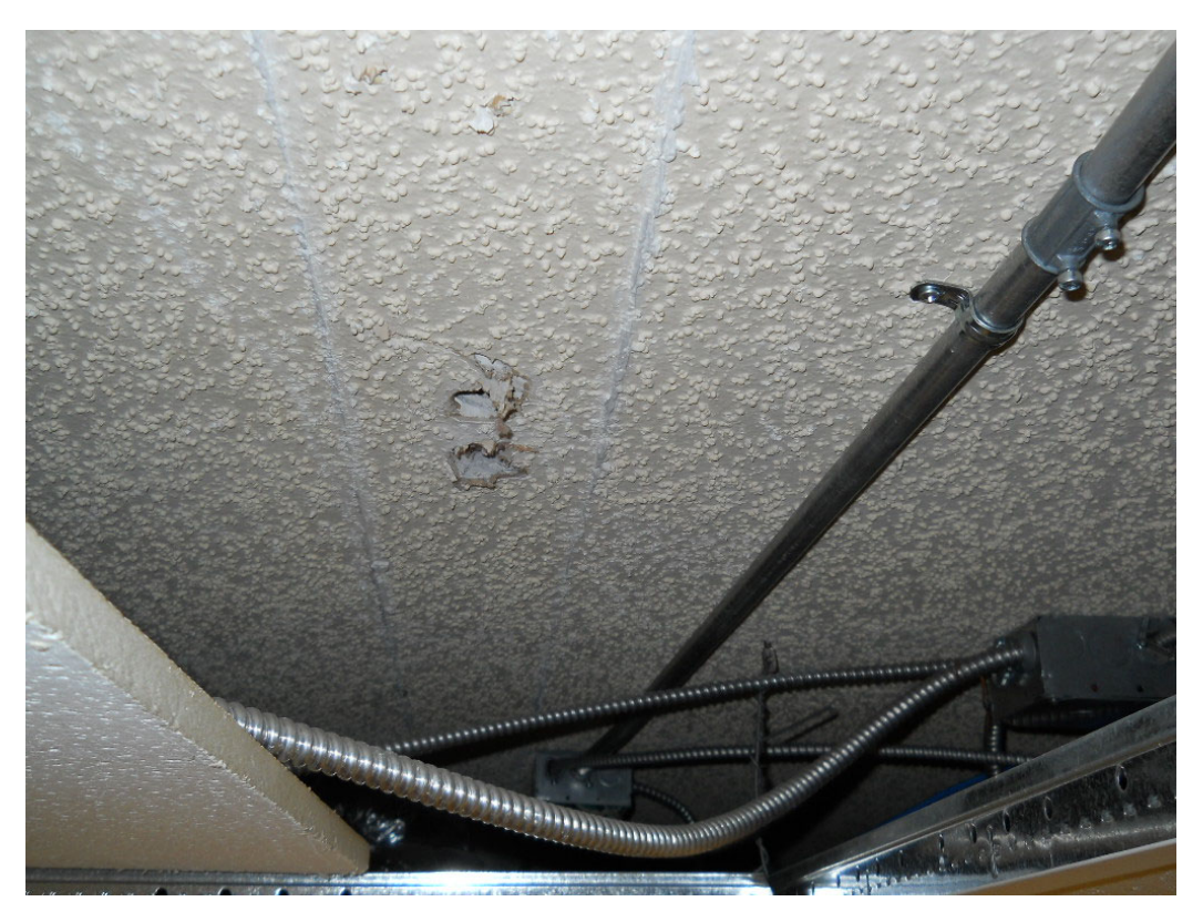
PHOTO 9 – 9/29/21 – LOCALIZED DAMAGE AND AIR EROSION OF CEILING TREATMENT ABOVE ROOM 15