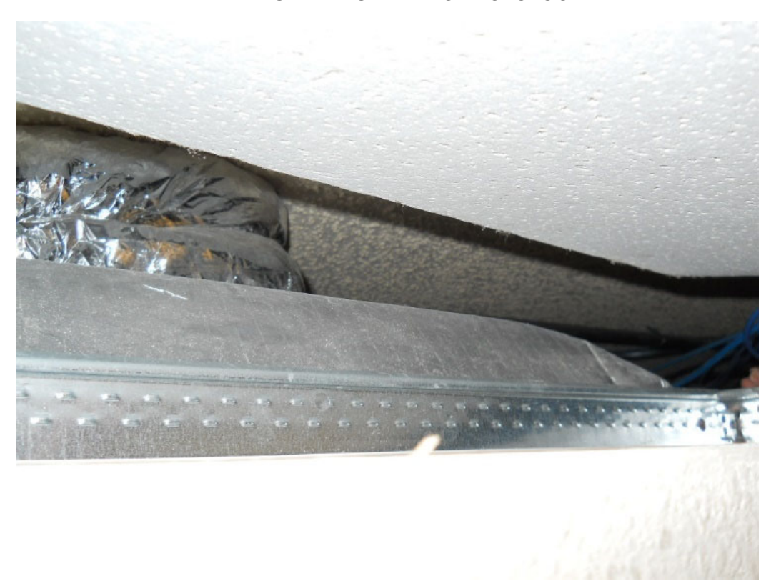
PHOTO 7 - 9/29/21 - APPARENT AIR EROSION OF CEILING TREATMENT IN THE EASTERN HALLWAY