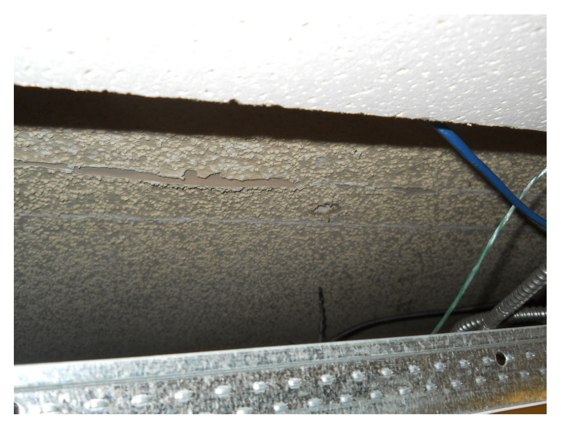
PHOTO 11 - 9/29/21 – PEELING CEILING TREATMENT SOUTHERN PORTION OF THE BUILDING