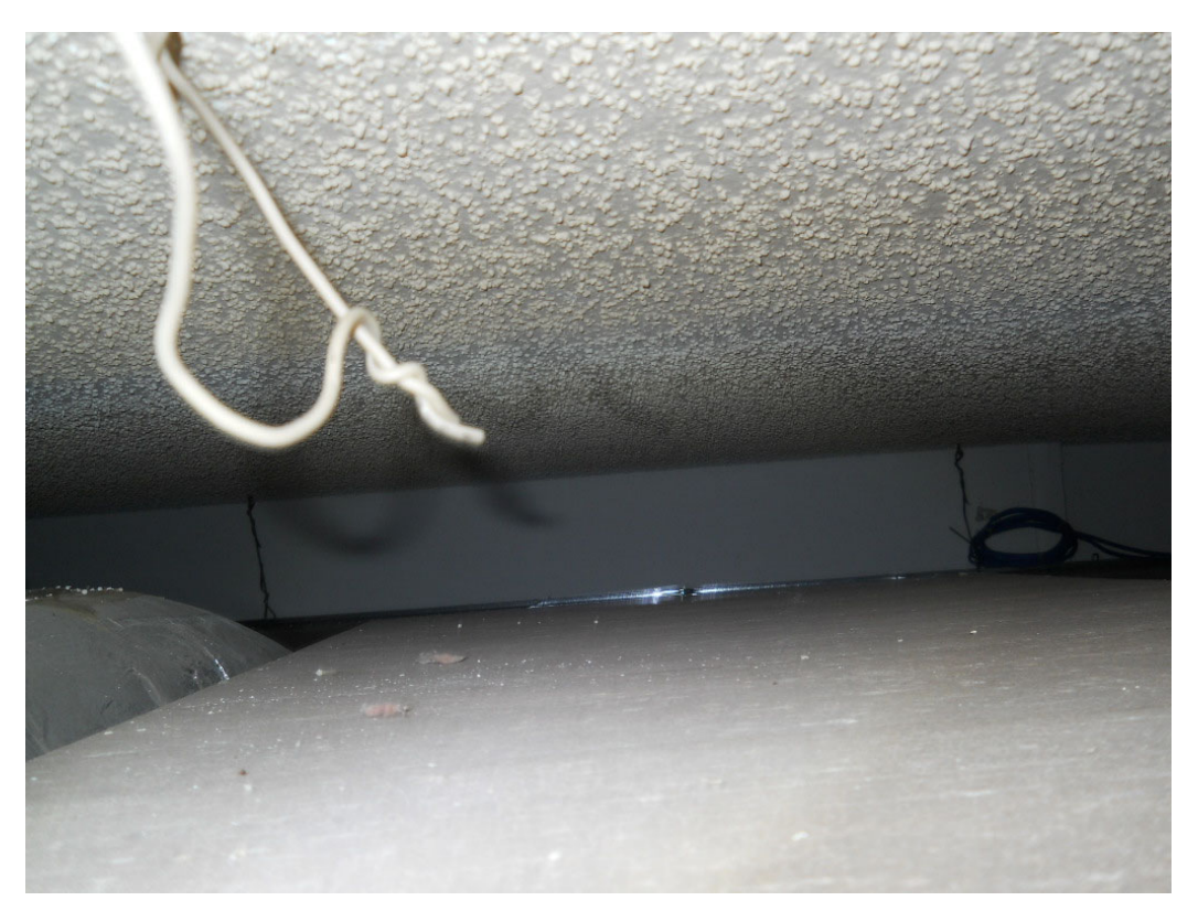
PHOTO 13 – 9/29/21 – APPARENT AIR EROSION AND DELAMINATION CEILING TREATMENT ABOVE ROOMS 24 AND 25