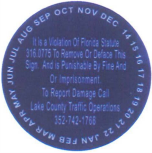
3" Diameter Blue Background White Lettering Start Date 2022