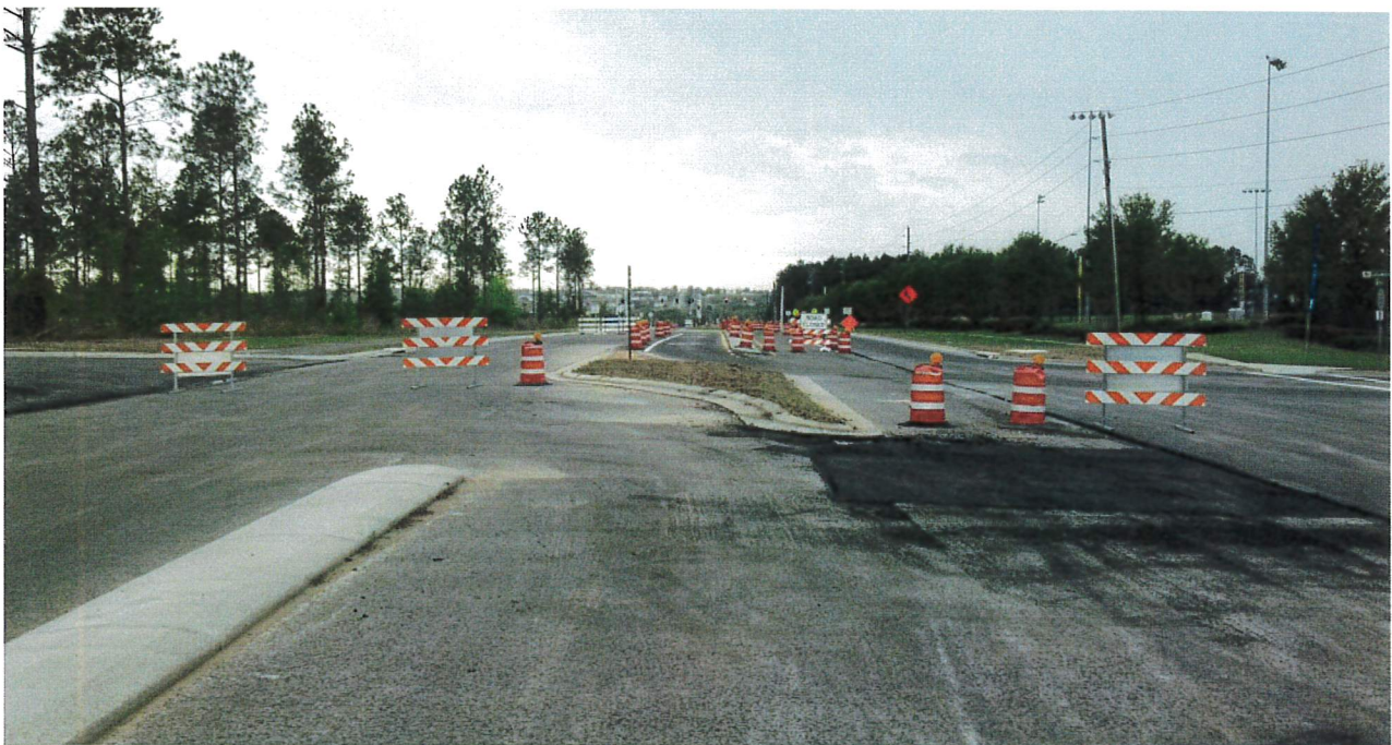
North end of project