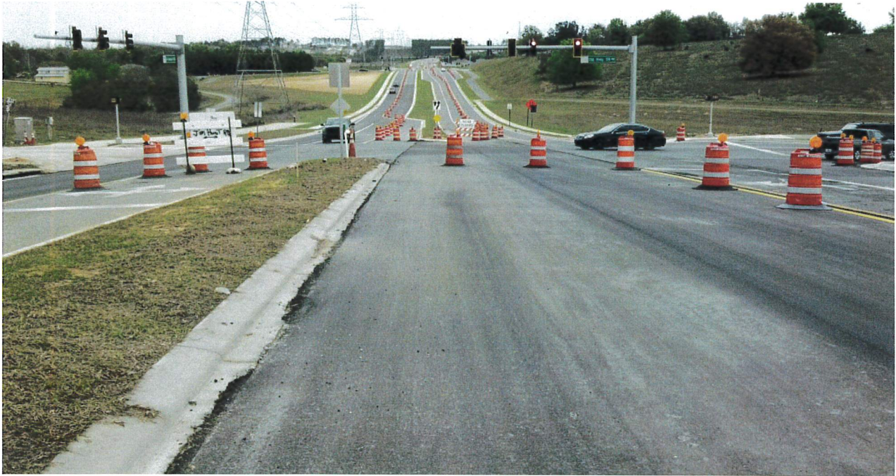
East Old Hwy 50 to new intersection