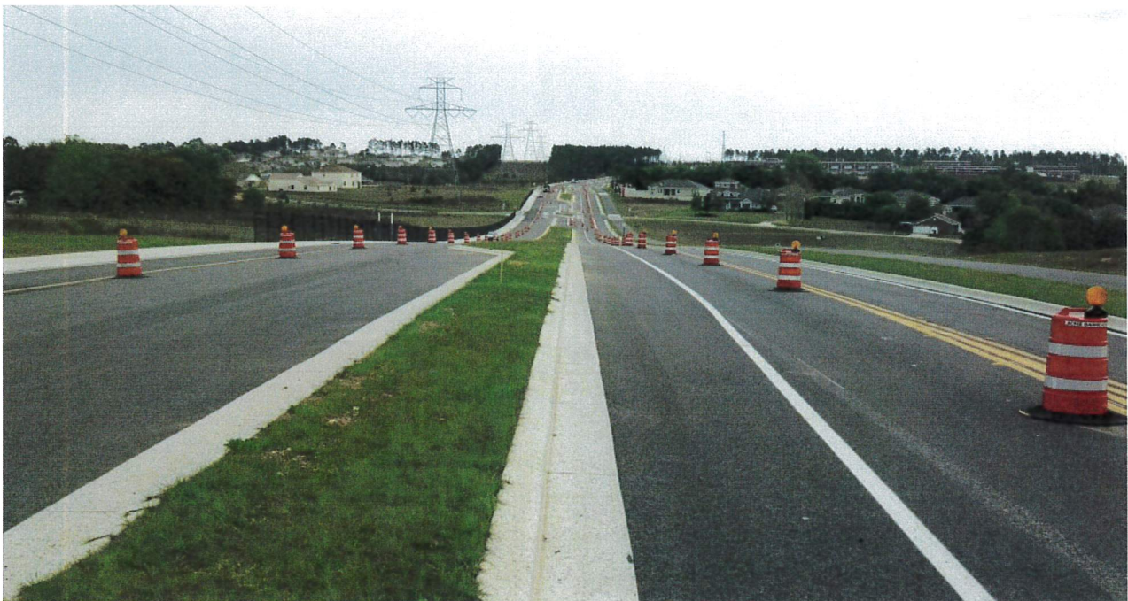
North from new intersection with Old Hwy 50 West