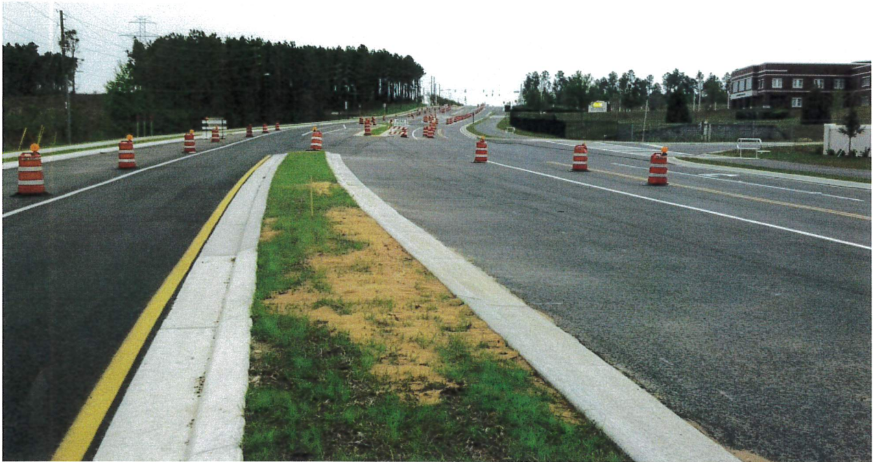
North from Bridger Trail Ct