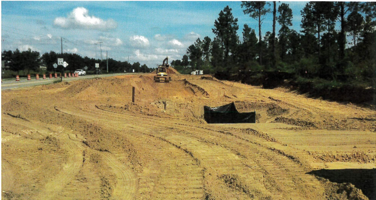
View north from Fosgate Rd