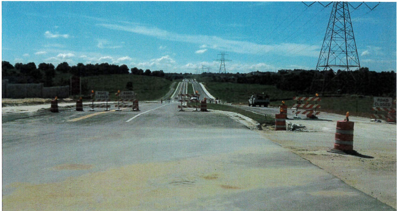
View south from Jim Hunt Rd