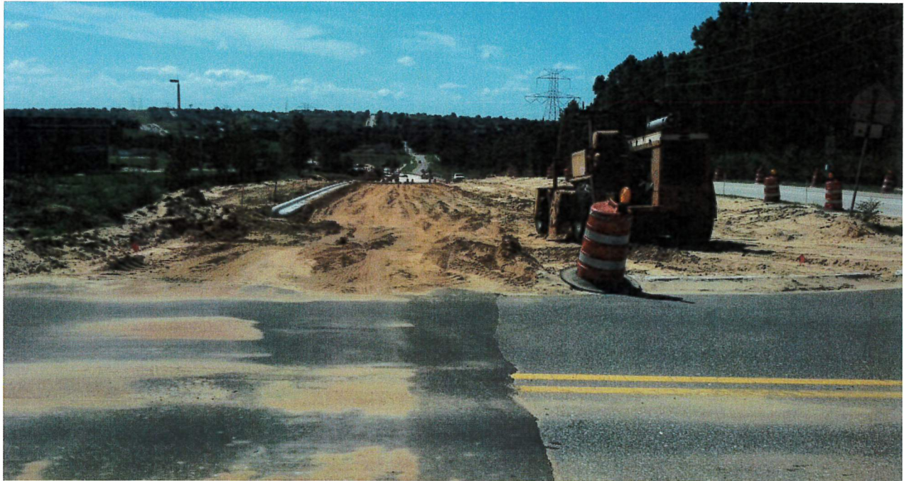
East side of Hancock @ Fosgate Rd