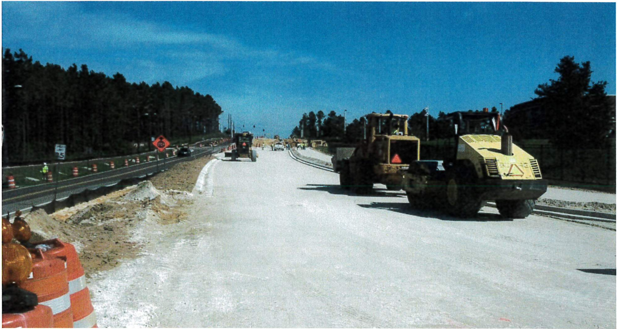
View north @ HS Bus Access Rd