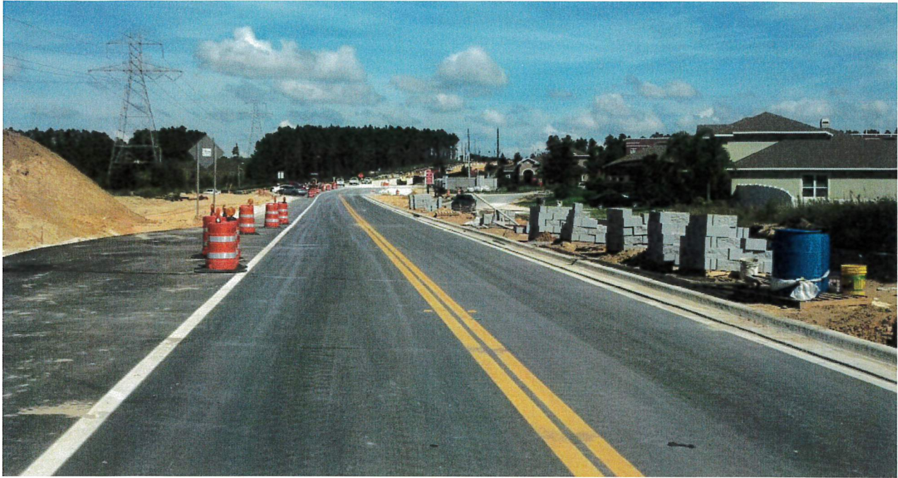
View north towards Big Sky Dr