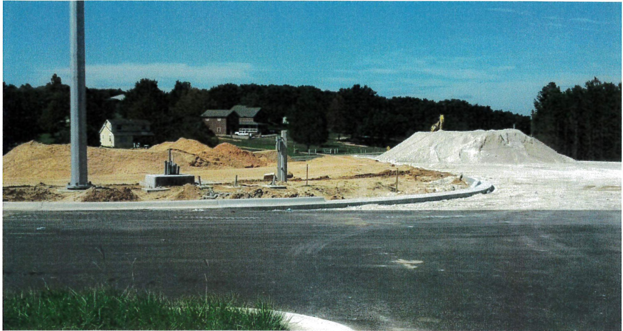
Intersection @ future realignment of West Old Hwy 50