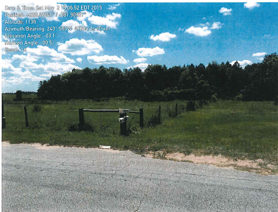
View West (Eden Lane Ext.)