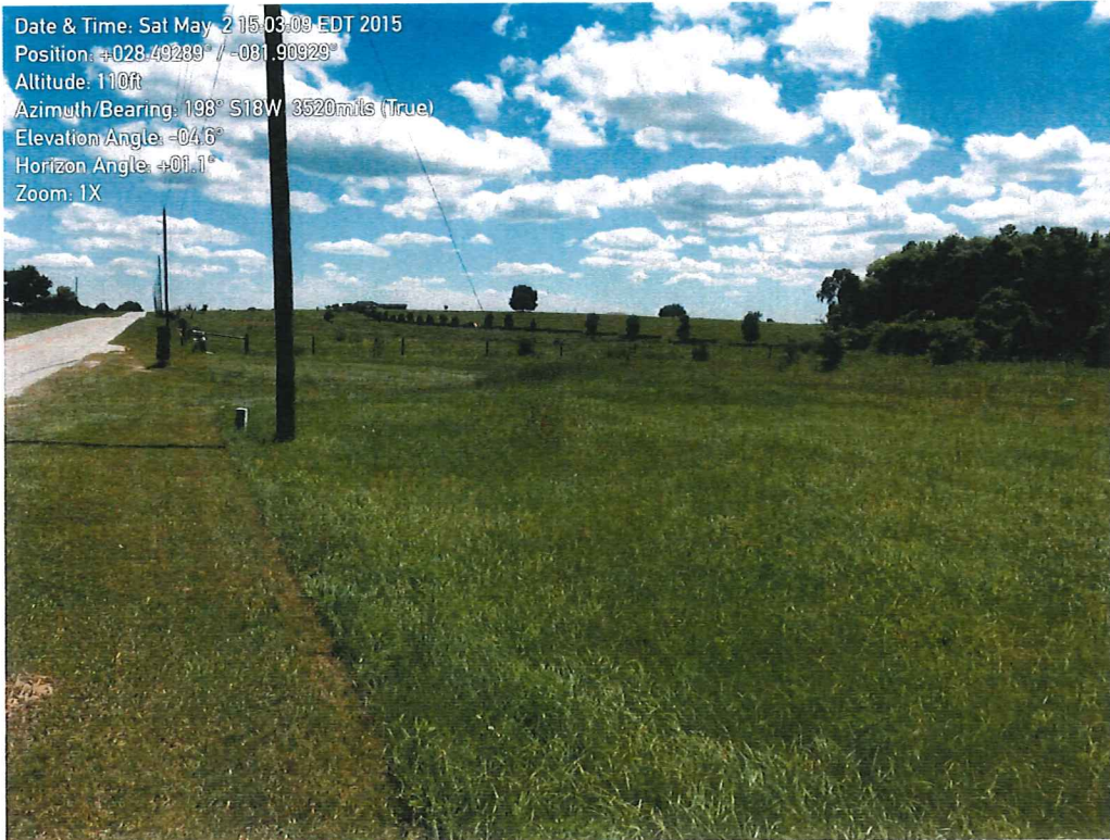
View Downstream (Eden Lane Ext.)