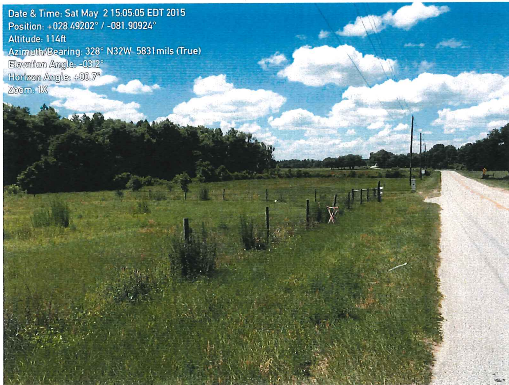
View Upstream (Eden Lane Ext.)