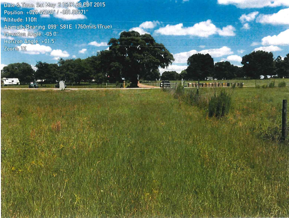
View East (Eden Lane Ext.)