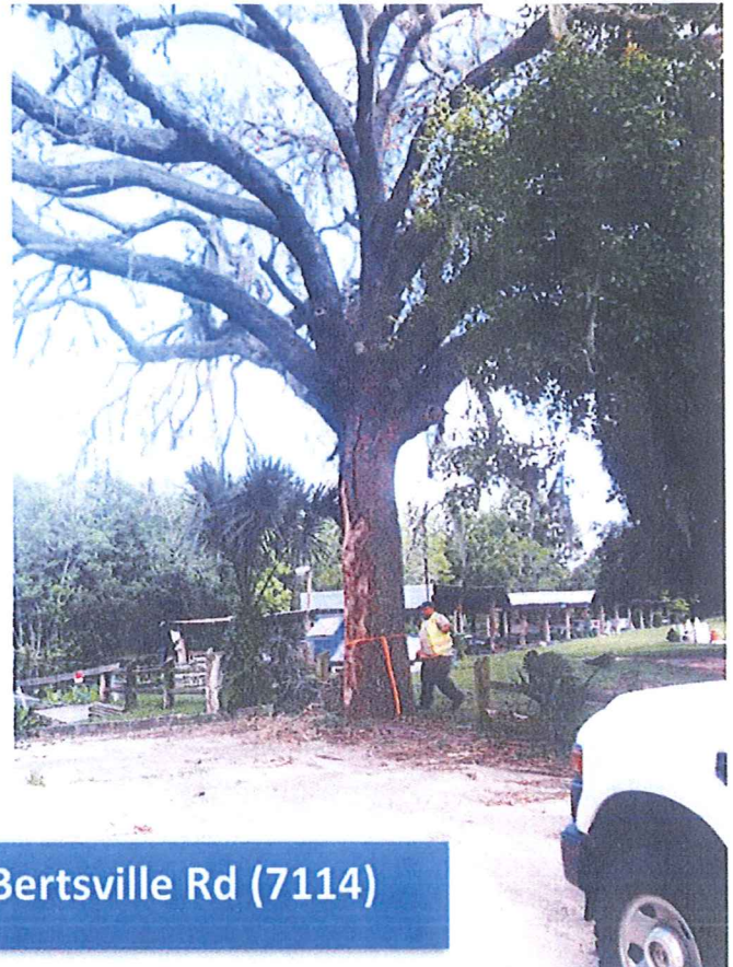
Oak to be removed on Bertsville Rd (7114)