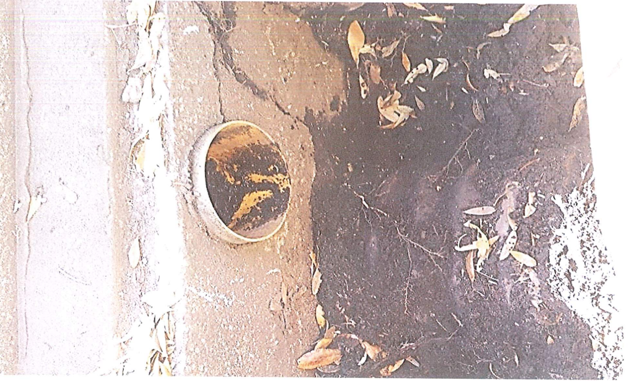
East Harbor Dr