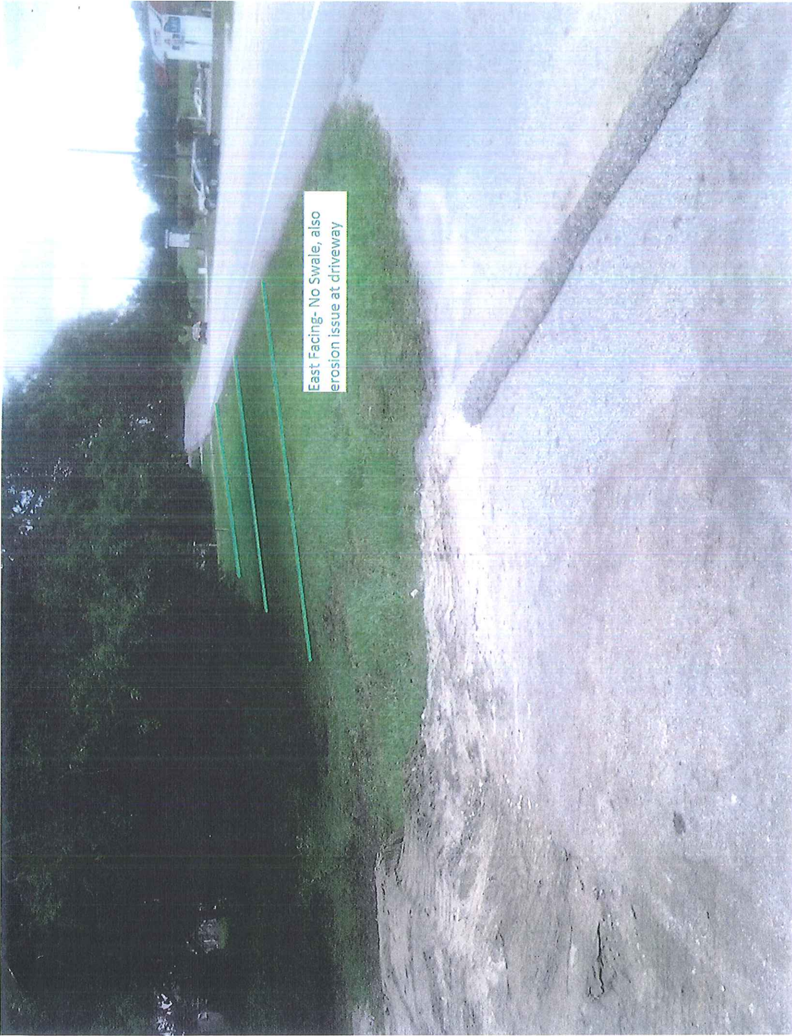
East Facing- No Swale, also erosion issue at driveway