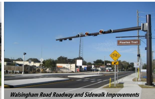
Walsingham Road Roadway and Sidewalk Improvements