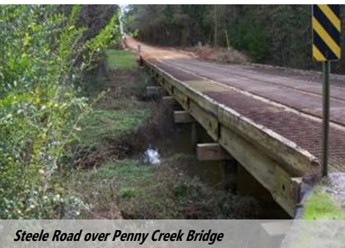
Steele Road over Penny Creek Bridge