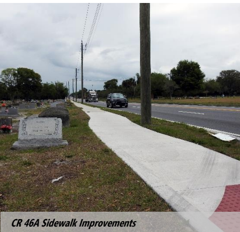
CR 46A Sidewalk Improvements