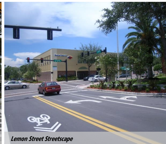
Lemon Street Streetscape