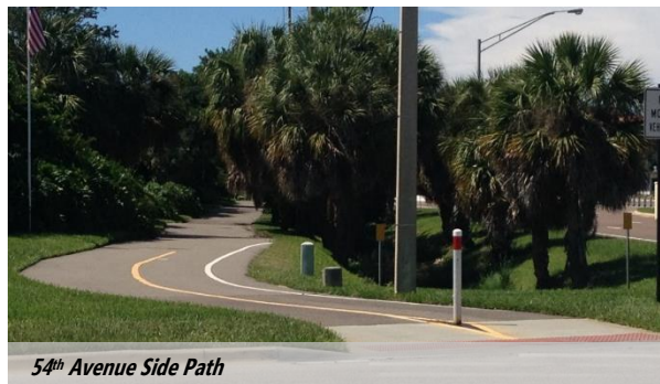
54 th Avenue Side Path