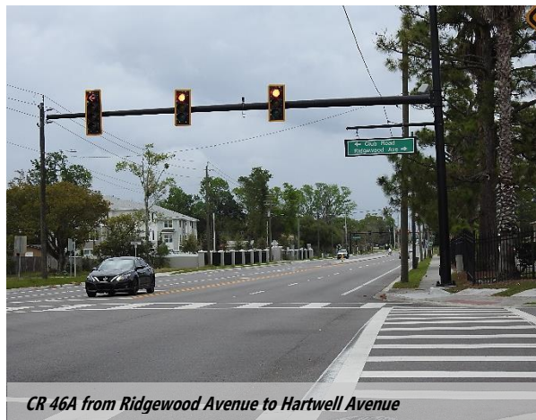
CR 46A from Ridgewood Avenue to Hartwell Avenue