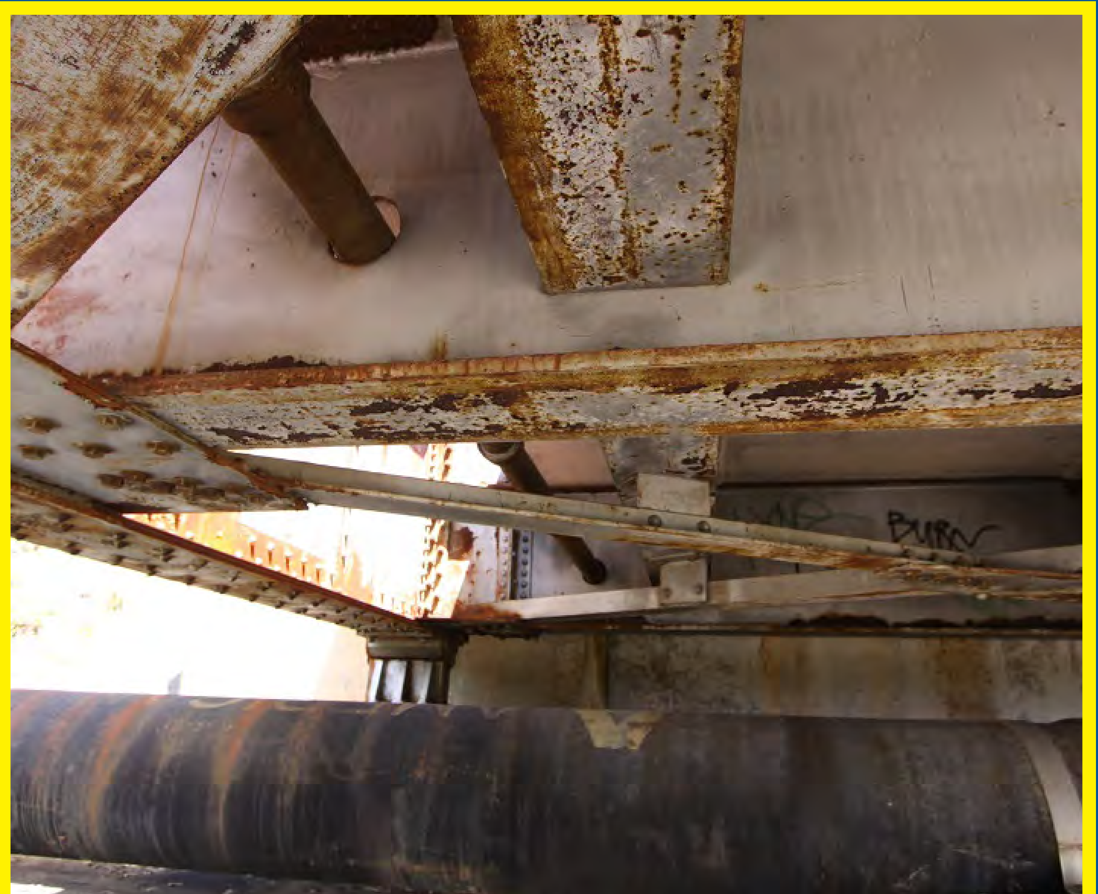
Utility Pipe at Abutment