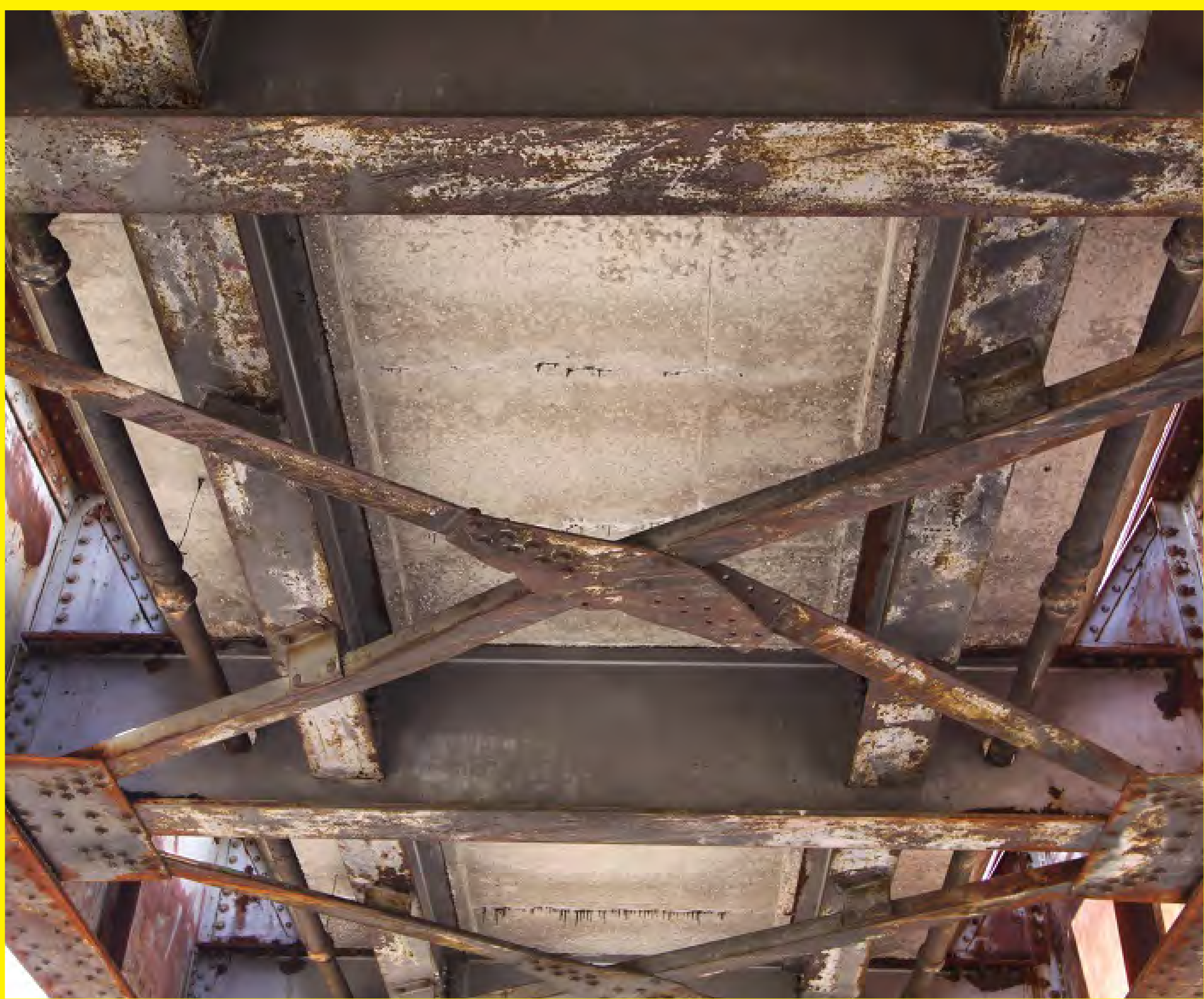
Underside of Deck