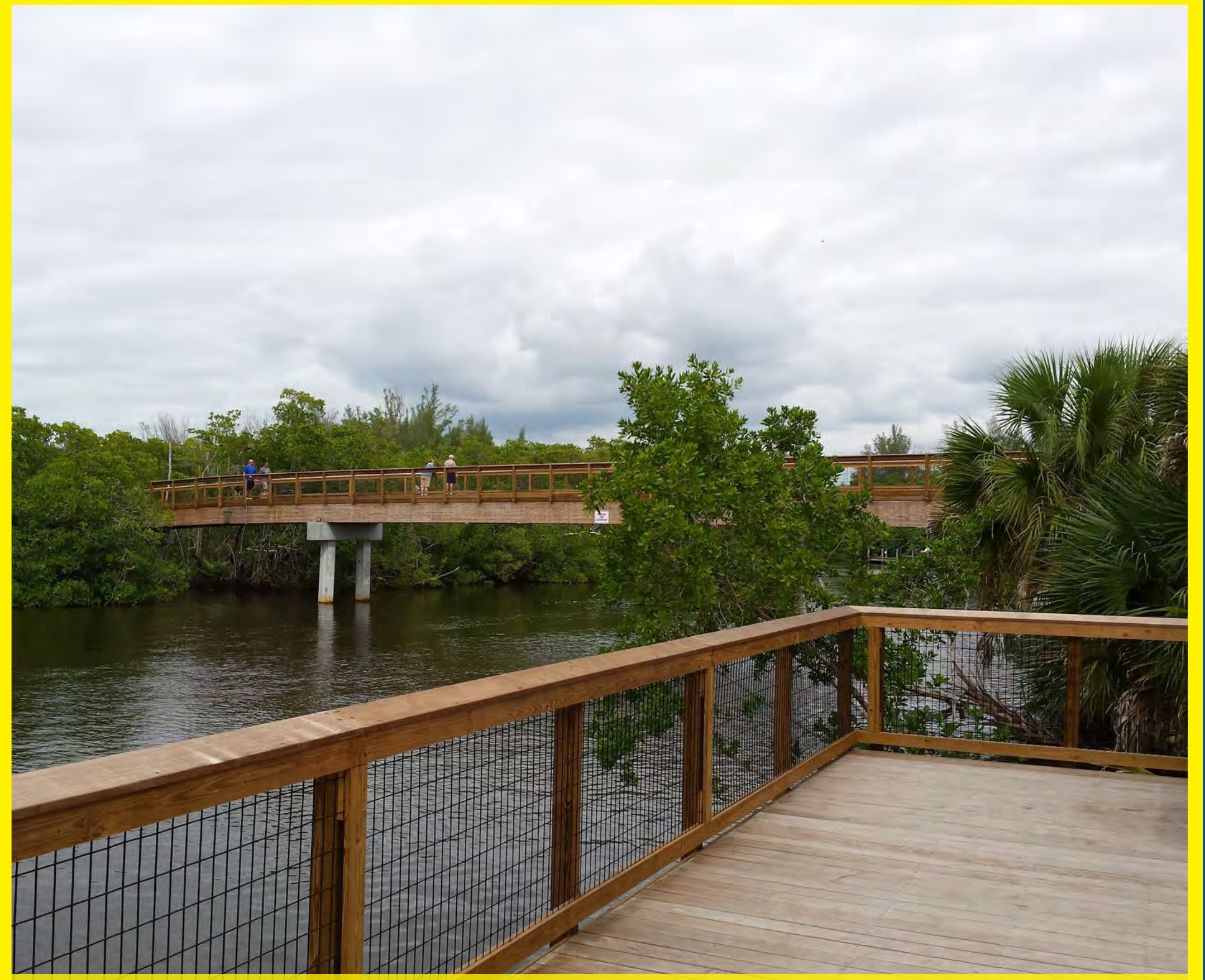
Ipe with Mesh