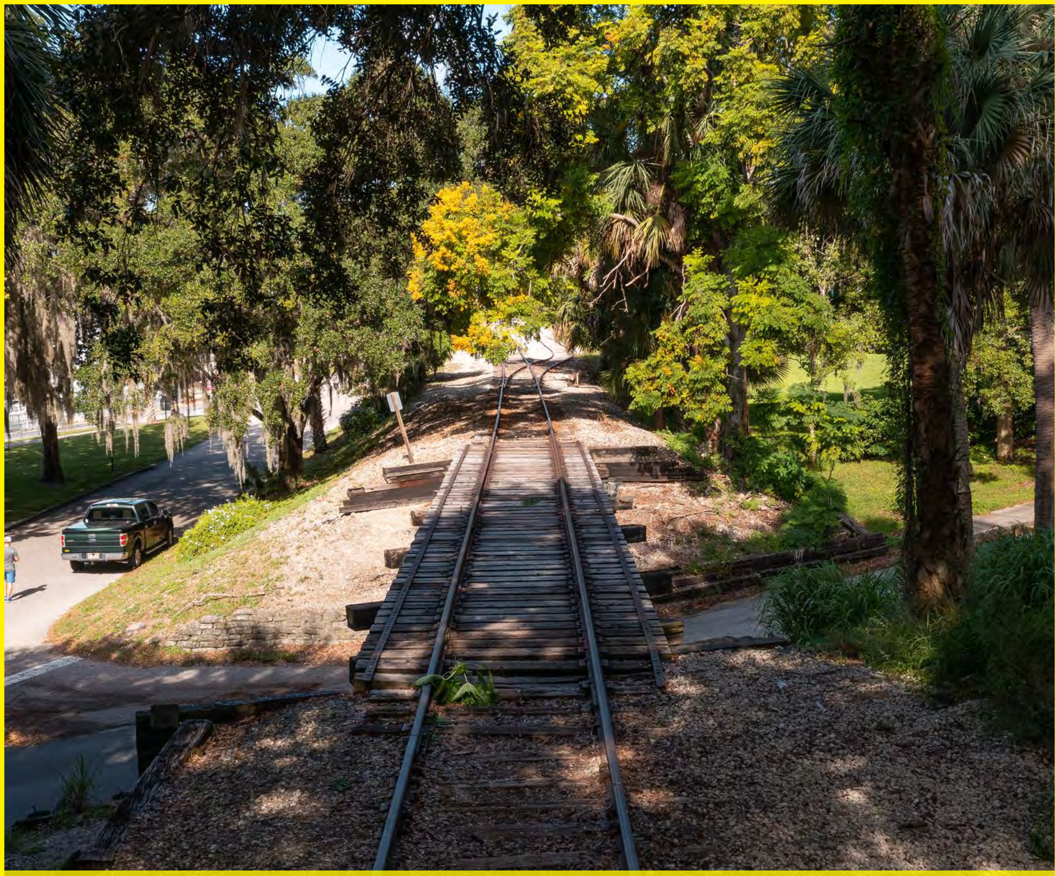
Tremain Street & Charles Avenue from Rail Perspective