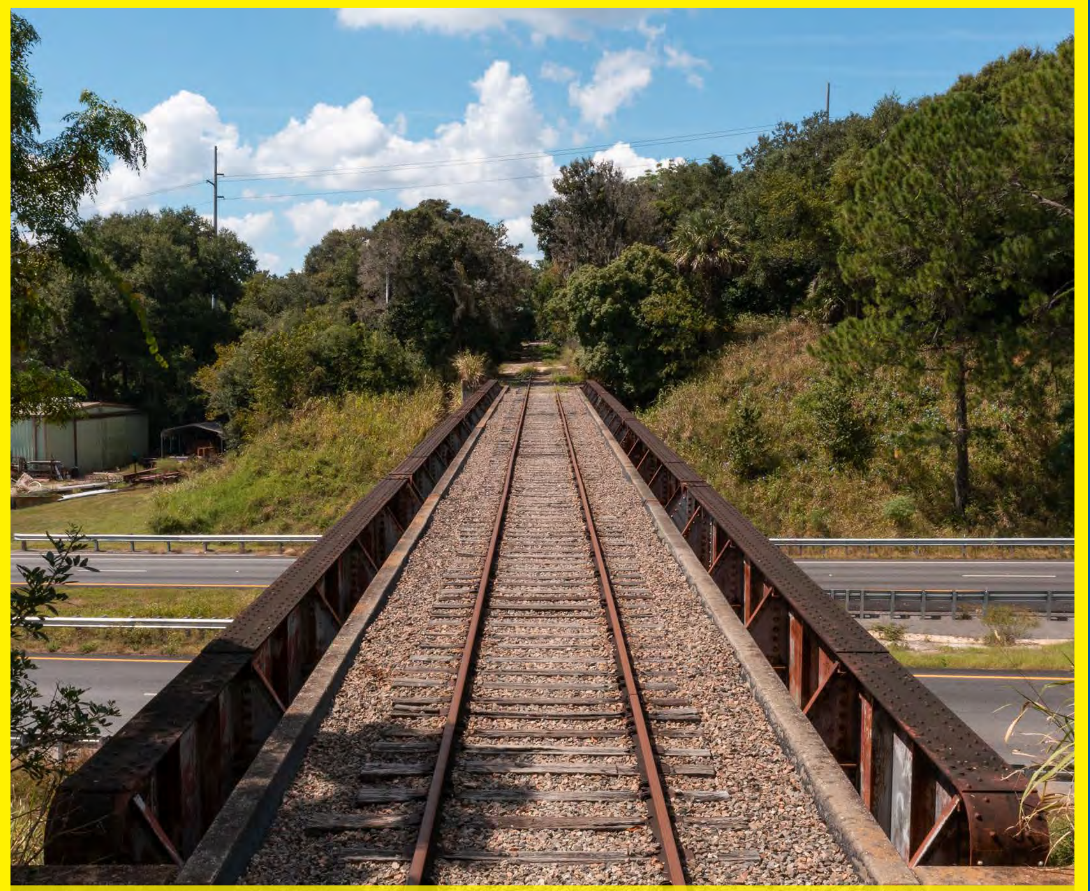
Typical Bridge Section