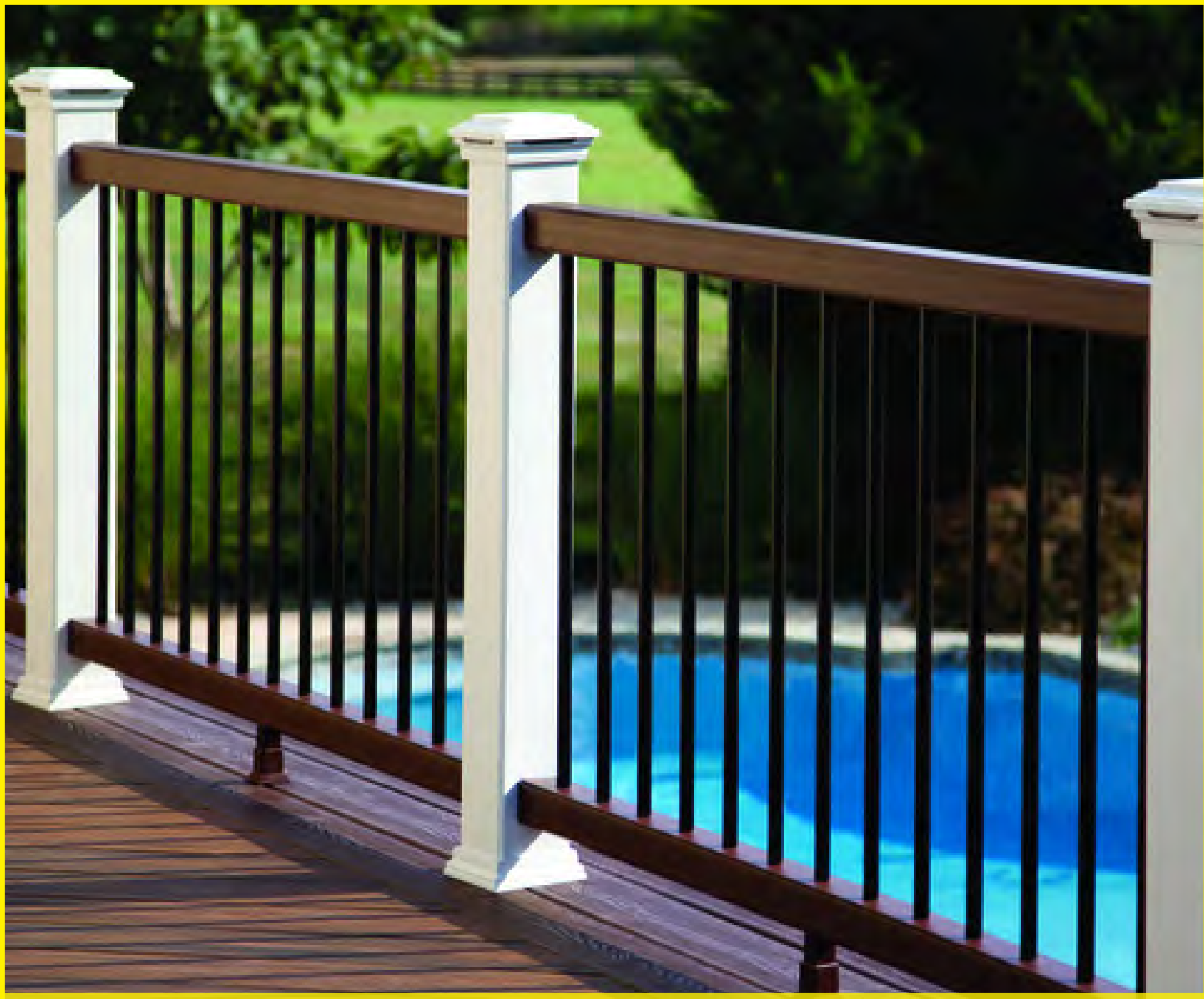
Composite or Wood Picket