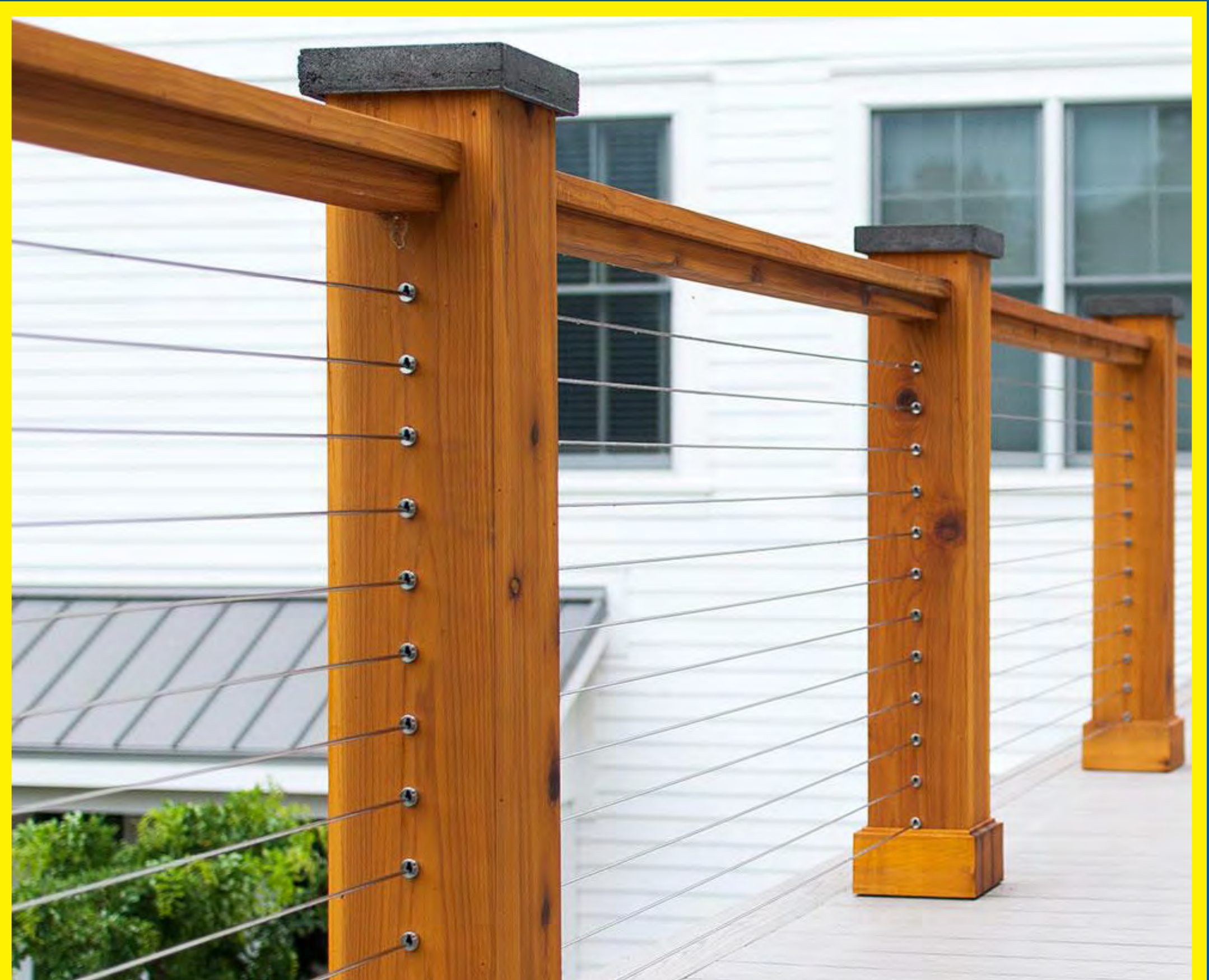
Wood Post with Cables