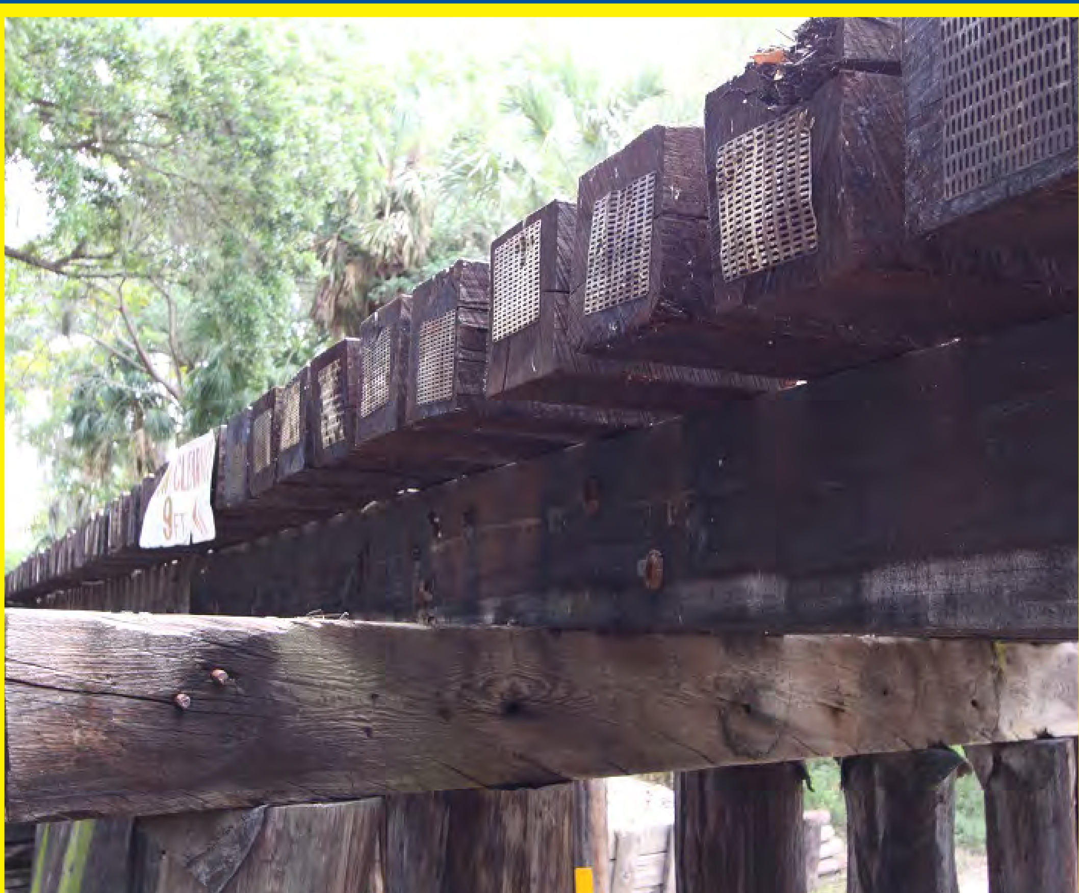
Existing Cap and Stringers