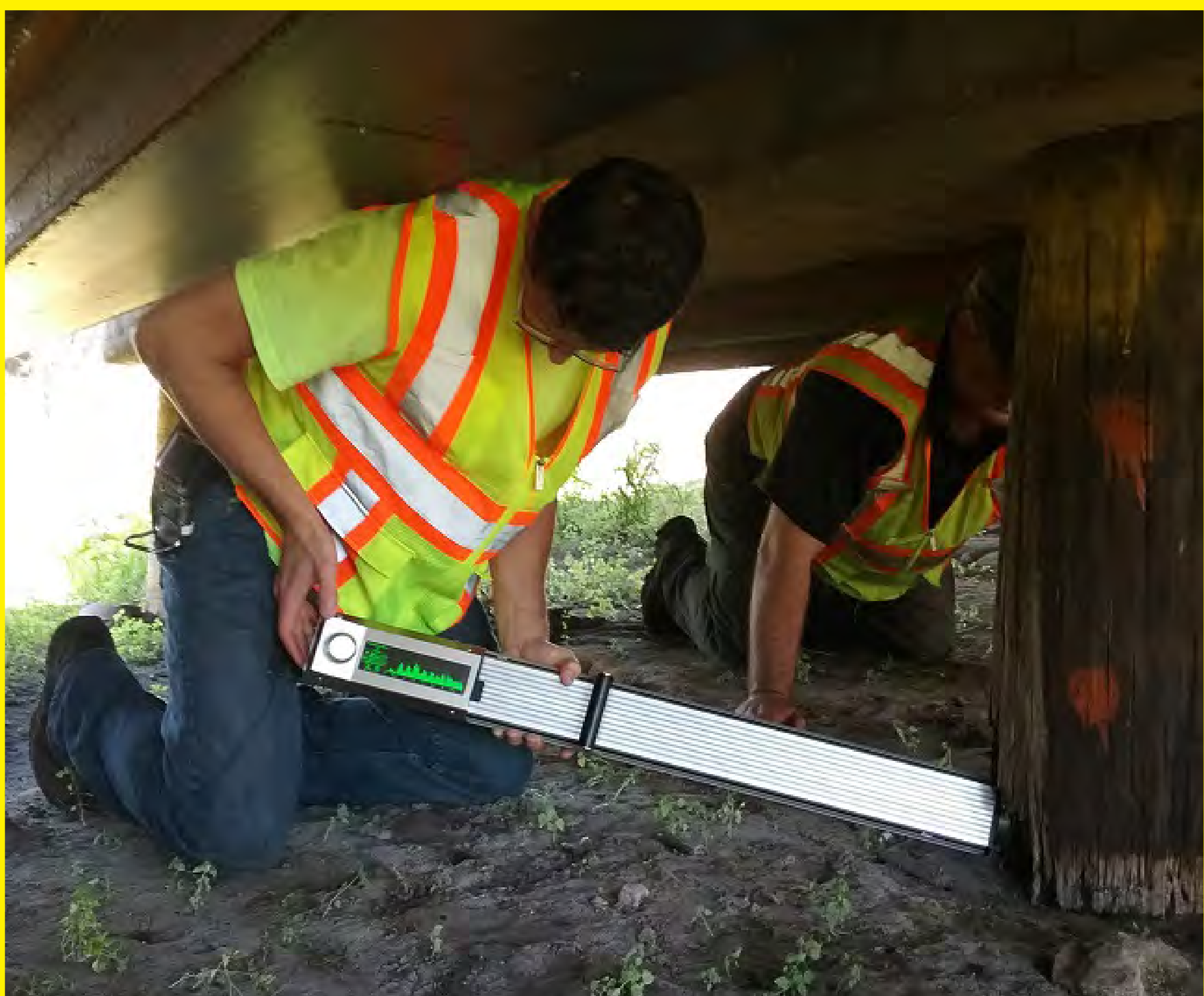
Drill Resistance Device