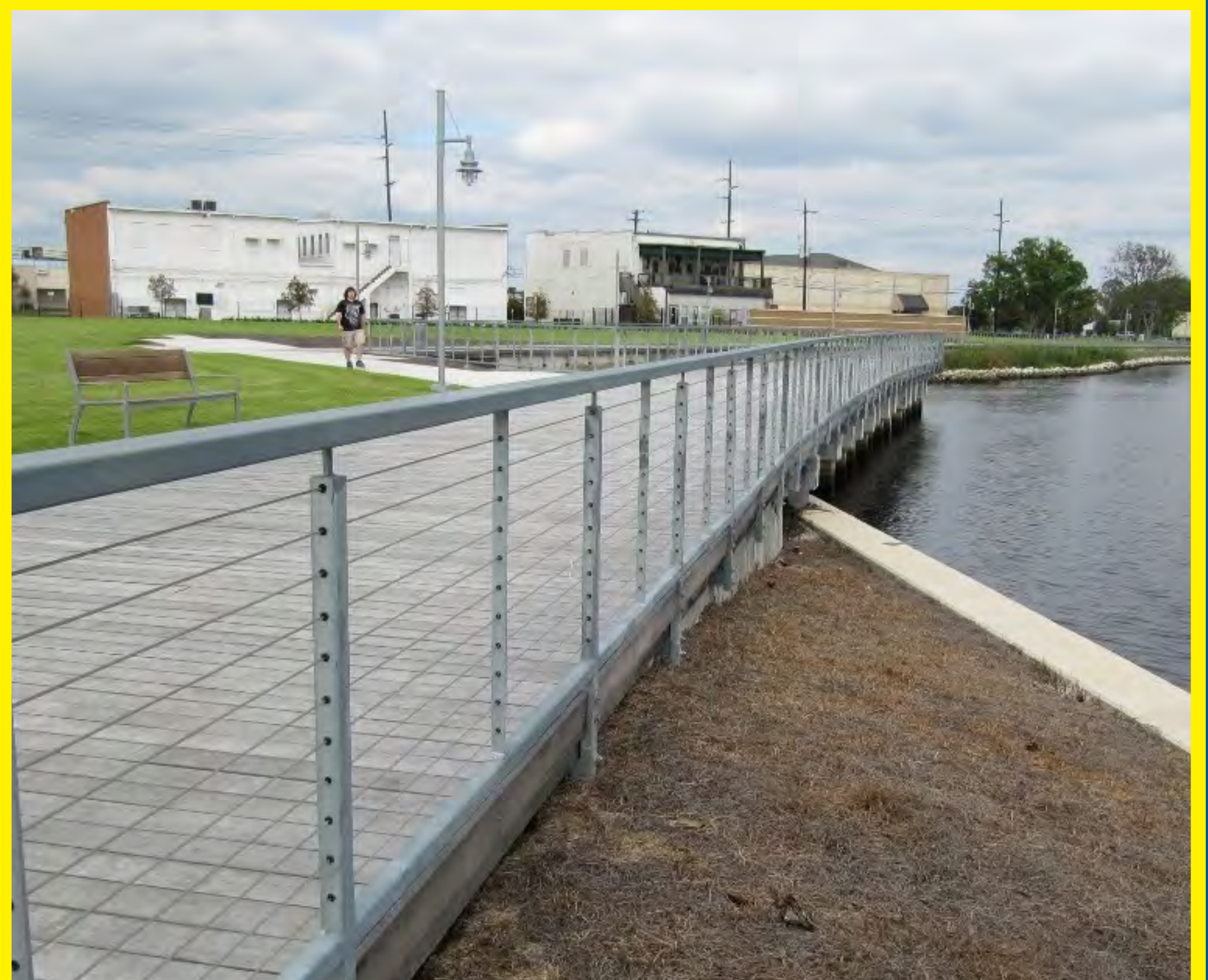
Metal with Cables