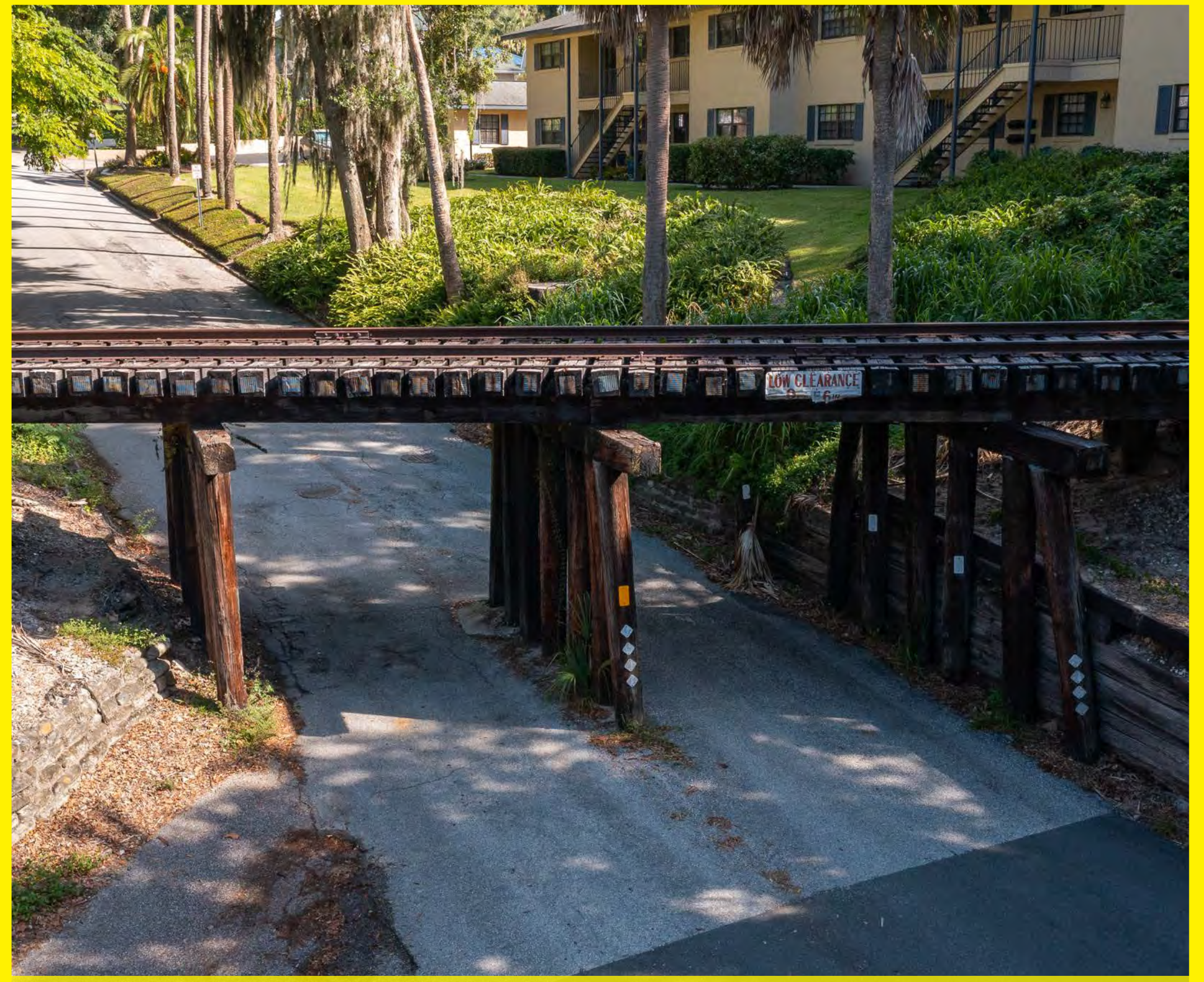
Tremain Street & Charles Avenue from Street Perspective