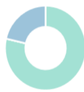
Total Bidders 14