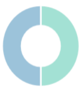
Total Bids 42