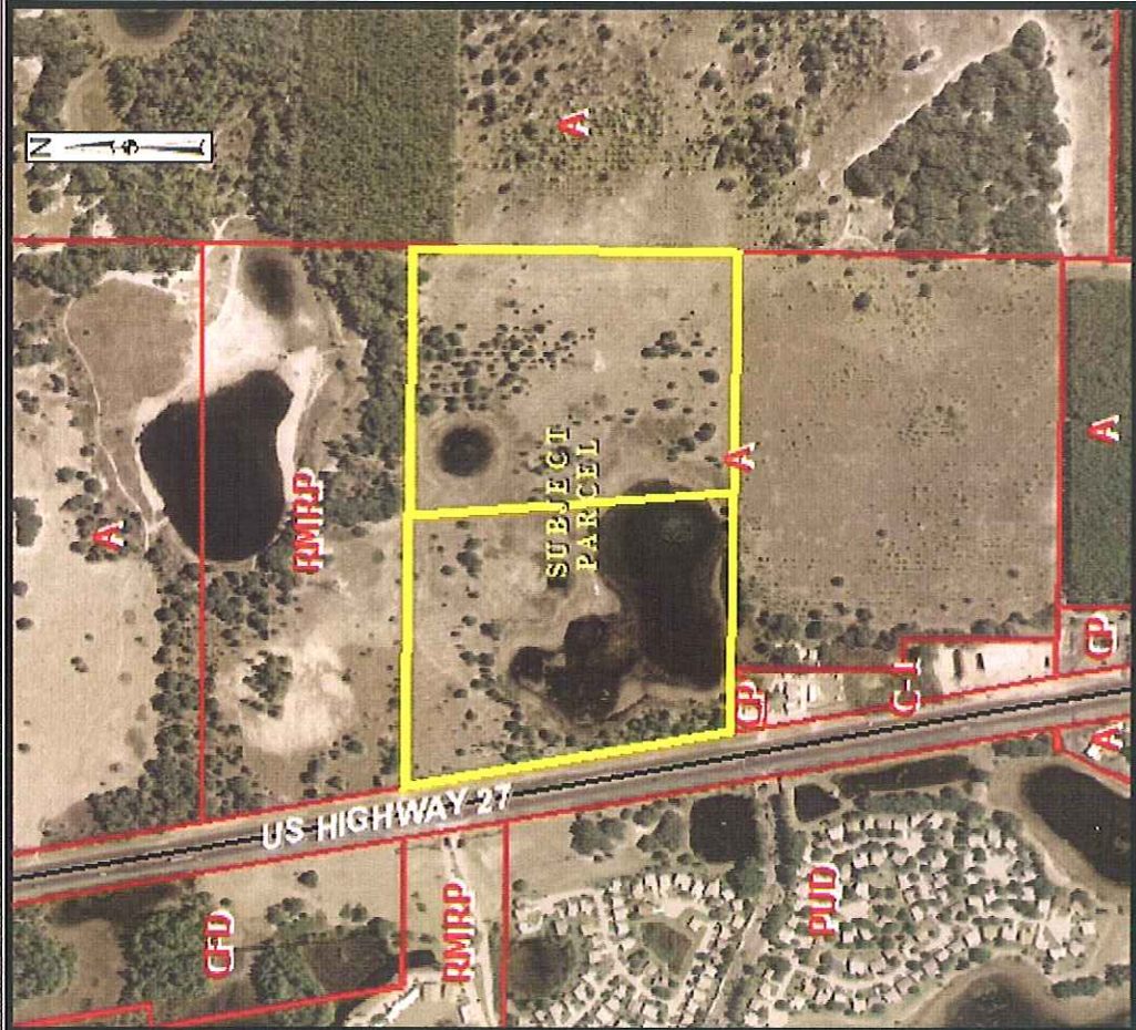
CURRENT ZONING AGRICULTURE (A)