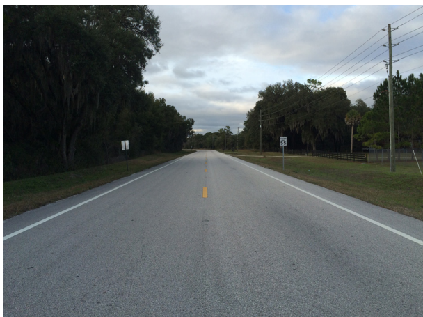
CR 501 Phase II - Existing Conditions

As it exists today, CR 501 is a two-lane undivided rural roadway with a posted speed limit of 55 mph. Proposed improvements will include widening to four lanes, constructing a 22.5-foot grassed and landscaped median to provide separation between the two directions of travel, and construction of a closed curb and gutter stormwater system that will connect—by way of joint-use ponds—with adjacent properties through an existing Public-Private Partnership (PPP) agreement.