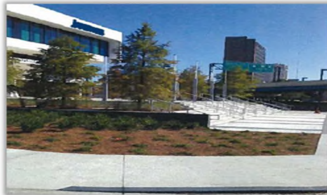
City of Jacksonville: Chamber of Commerce Landscape Improvements – District 2