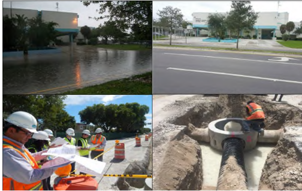
SW 212 Drainage Improvement – District 6