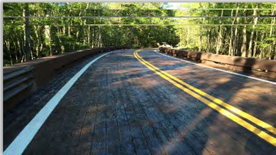
Leon County: Natural Bridge Road – District 3

LAP agencies prioritize and fund local projects (through their respective MPO or governing board) and are then eligible for reimbursement for the services provided to the traveling public through compliance with applicable Federal statutes, rules and regulations.