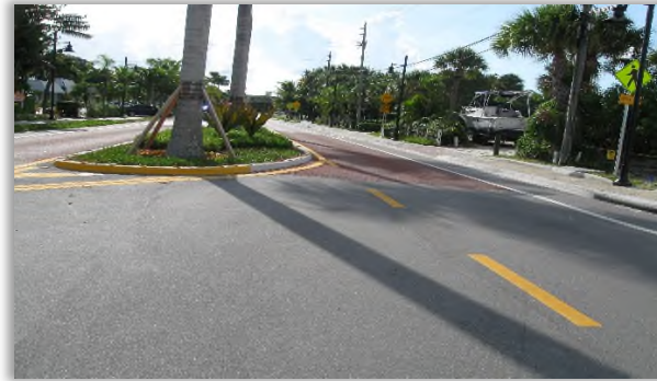
City of Jupiter: A1A Roadway Project– District 4