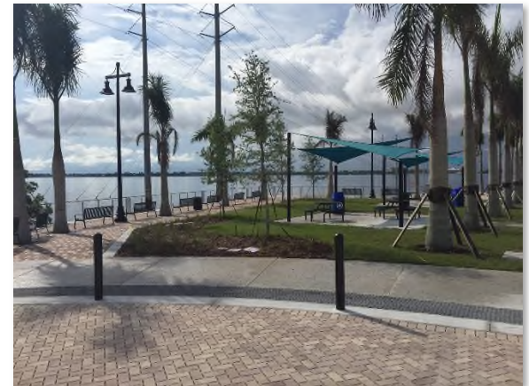
Gateway Harborwalk Phase 1 – District 1