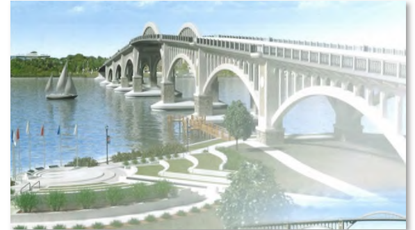
Veterans Memorial Bridge– District 5