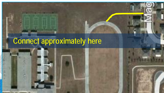
Connect approximately here