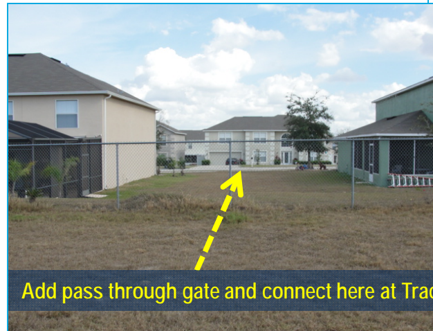
Add pass through gate and connect here at Tract M