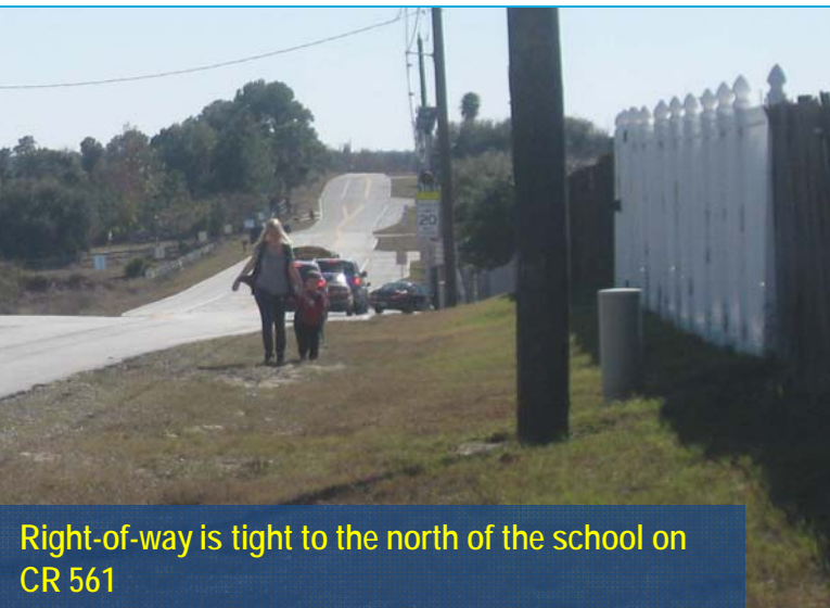
Right-of-way is tight to the north of the school on CR 561