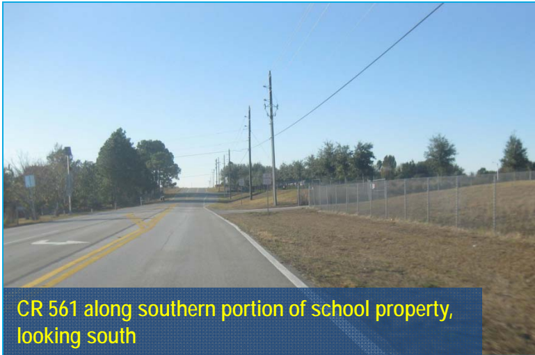
CR 561 along southern portion of school property, looking south