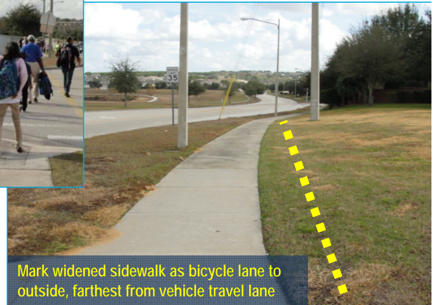
Mark widened sidewalk as bicycle lane to outside, farthest from vehicle travel lane