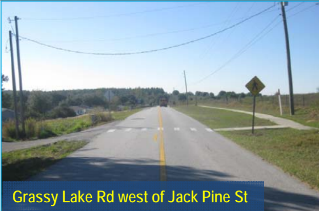
Grassy Lake Rd west of Jack Pine St