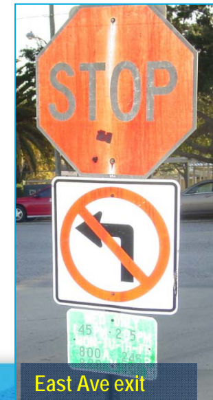
East Ave exit