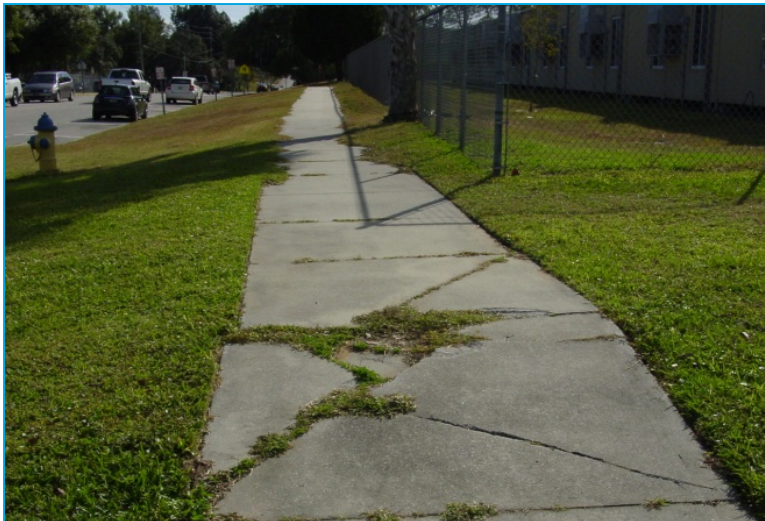
East Ave Sidewalk south of the school driveway