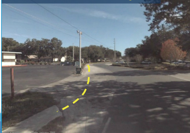
Griffin Rd East of US 441, Looking East