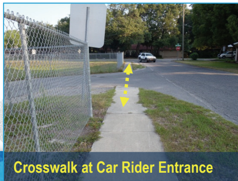
Crosswalk at Car Rider Entrance