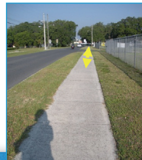
Crosswalk on (lt) and Across (rt) Griffin Rd