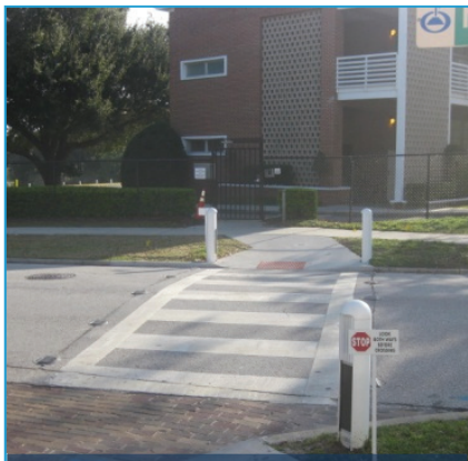
Example Ladder Style Crosswalk