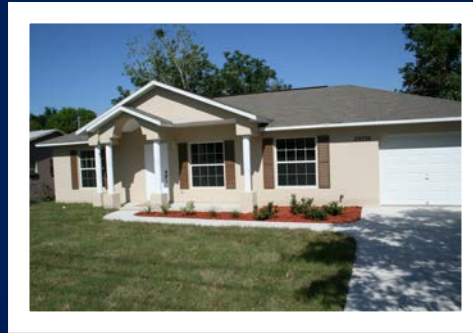
Health & Human Services