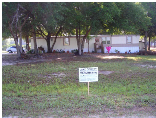
Views of the postings