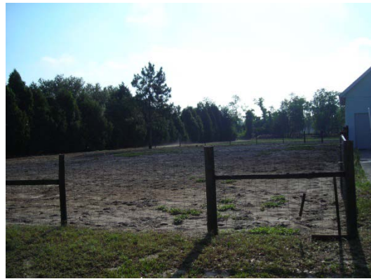
Views of the site